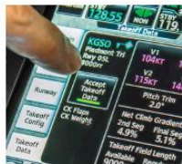
Advanced Integrated Takeoff and Landing (TOLD)