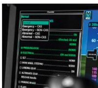
Enhanced Electronic Checklist