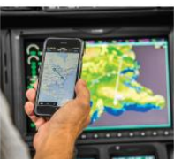
FlightStream 510 Compatibility

With a reduced takeoff field length, the HondaJet APMG gives fliers greater access to airport locations