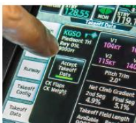
Advanced Integrated Takeoff and Landing (TOLD)